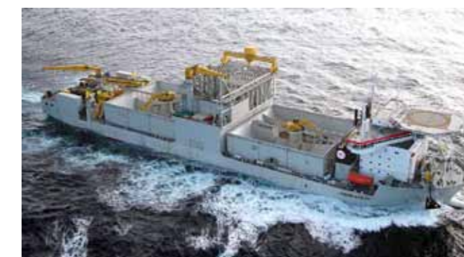
Top: The Tangaroa